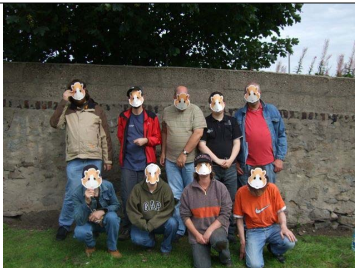
The Guerrilla Gardeners in cunning Guinea Pig Disguise

The Climate Challenge Fund ~ offers grants to a range of community organisations. Projects can involve a range of actions, from helping us to use less energy, or walk and cycle more, to local sustainable food delivered in the context of the wider environmental, social and economic dimensions, that give people new skills, improve health, help them to work together or provide better community facilities, but carbon reduction must be at the heart of every proposal. http://www.infoscotland.com/gogreener/CCC_FirstPage.jsp