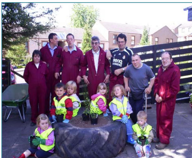
Lilybank Biodiversity team and children from the Wendyhouse Nursery

The service users and volunteers at Lilybank Resource Centre are not only looking back on a year of gardening and personal achievement in 2008 but looking forward to doing even more in 2009!