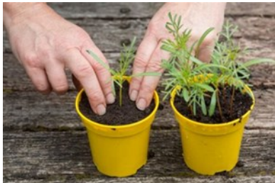
Potting up seedlings

Step 5 The seedlings will now grow several pairs of leaves. At this stage you can pot them up into a slightly larger pot, 7cm, using multi purpose compost to feed them. Use a pencil or similar to loosen the roots and only hold the seedling leaves to move it, any damage to the stem will kill the little plant. Grow on without cover, ensuring the compost is moist, not wet, and the small plant is covered from