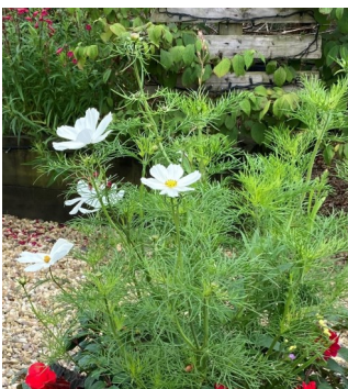
Planted in the garden

If you want to plant into a garden bed , then ensure they have well drained soil and a sunny place. And if you have grown a tall variety you will have to stake with a bamboo cane or similar to prevent the plant from falling to one side. Dwarf varieties don't need staking.