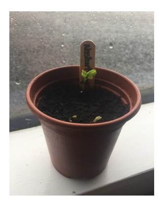
Step 2 Hello Seedling!

Step 2. The seeds will sprout through the compost after 5-7 days. Don't worry if they all don't appear.