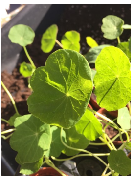
Step 3 Out you go

If it's frosty at night, be nice to them and bring them indoors. But remember to put them back outside the next morning. Keep the compost moist.