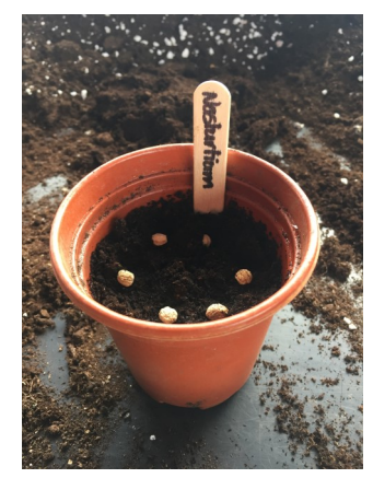
Step 1 Sow seeds

Start thinking of a funky container that you could make your wigwam in!